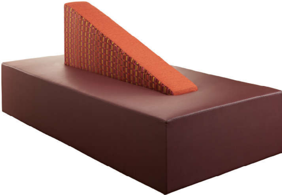
Custom Shape "Pablo" Design